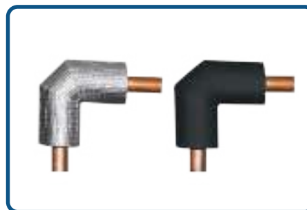
90° 3 Pieces Elbow