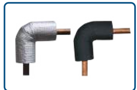
90° 4 Pieces Elbow

Size Availability: XLPE fittings available in wall thickness from 3/8" to 2" (10mm to 50mm) and ID's from 1/4" to 10" (6mm to 273mm). NBR fittings available in wall thickness from 1/4" to 1-1/4" (6mm to 32mm) and ID's from 1/4" to 2-5/8" (6mm to 67mm). (ID range is subject to variation depending on wall thickness).