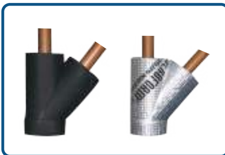
Y - Joint