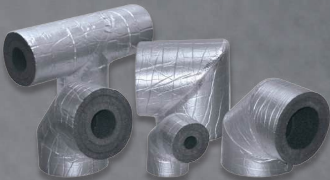
FlexiCell® Prefabricated Fittings

Prefabricated fittings are available in a variety of wall thicknesses and inner diameters.